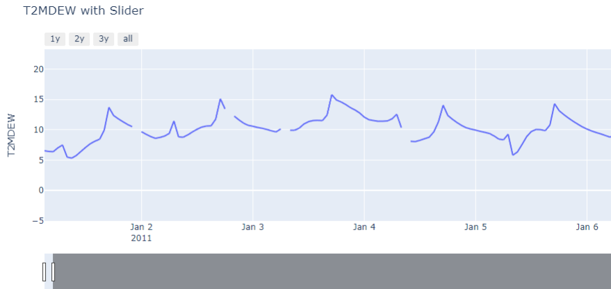
Figure 3. presence of missing values in the dew point parameter

Our dataset contains 8759 weather observations for the year 2011. When we visualize our dataset, we notice that it contains missing values. We have illustrated a single weather parameter such as the dew point symbolized by T2MDEW to visualize the missing values, as shown in Figure 3. Note that the other weather parameters also contain missing values. Interruptions in the Figure 3 symbolize the presence of missing values.