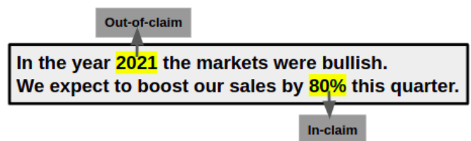
Figure 1: Numeral classification in Financial Texts

We followed the instructions provided the organizers of FinNum-3 and used Micro and Macro F1 scores for evaluation.