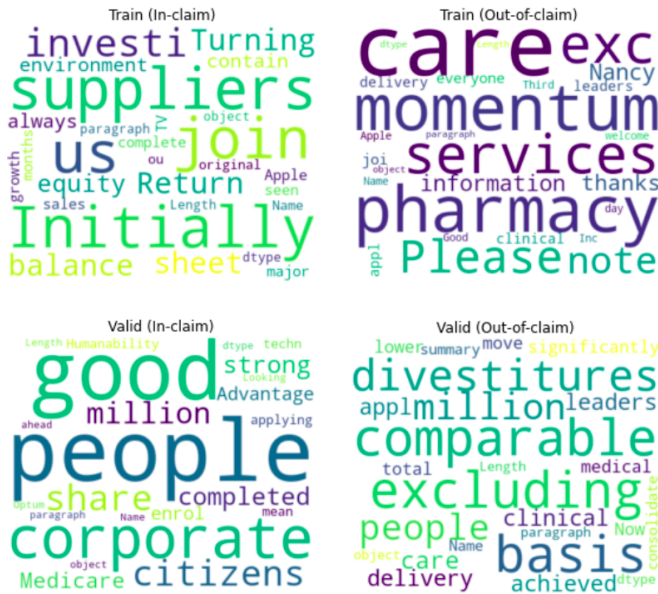
Figure 4: Word clouds of Training and Validation sets for each class

64 to 16. Everything else was the same. In the third model M3 , we used 768-dimensional context-based BERT [5] embedding of the target numeral for a context range of 6 words occurring before and after it. In addition to this, we used several hand-crafted features. This includes