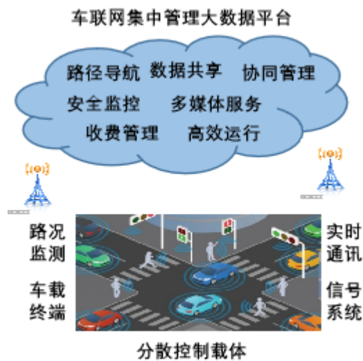
Figure 3 Distributed decentralized management and control mode

traffic administration through the smart grid of the general assembly data platform to realize data storage, data transmission, data mining and data analysis and processing functions, such as cars and people, vehicles and road, car and car information direct connectivity between, realize the industry and traffic administration of unmanned vehicles for effective control and supervision, and at the same time, provided professional multimedia and mobile Internet application services. Let people really feel the emerging travel mode and comfortable transportation experience brought by modern technology. The distributed decentralized management and control mode of the intelligent network vehicle is shown in figure 3.