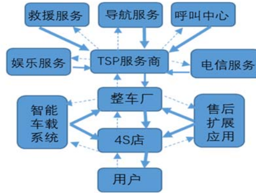
Figure 2 Schematic diagram of the development of intelligent network automobile industry chain