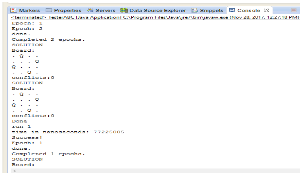
Figure 2: Screenshot of Run 1

Towards the begin, the underlying n scout honey bees are put aimlessly in VM on Cloud processing and n is that the scope of scout honey bees.